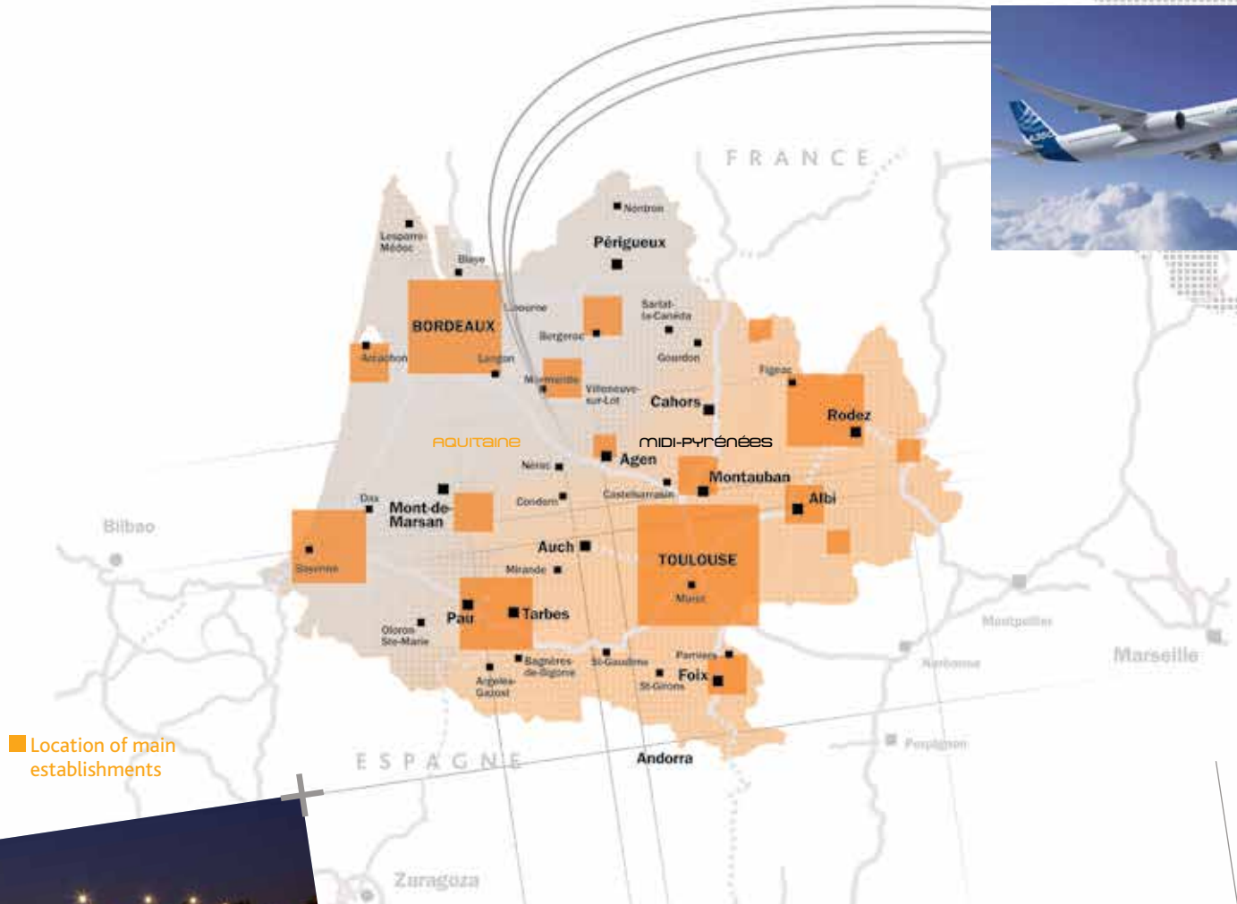
■ Location of main establishments